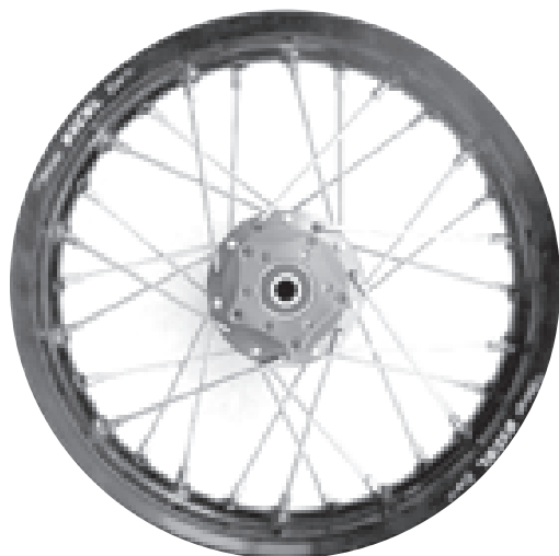
Correctly Laced Rear Wheel